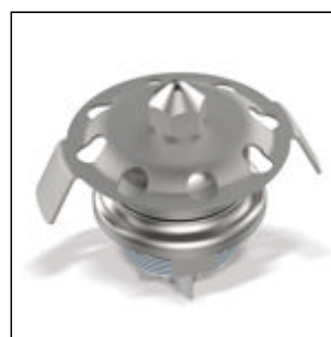
Milkshake base, optional