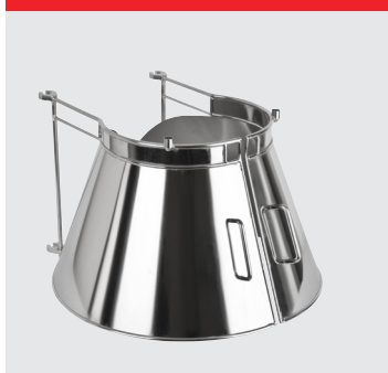
Removable splash guard in stainless steel. CE-certified