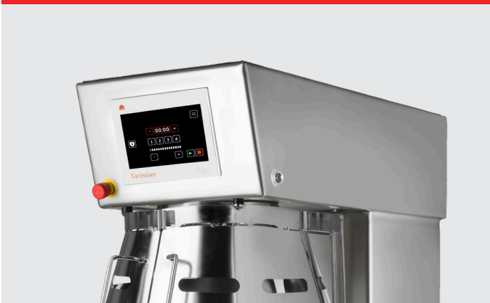
VL-5 – Automatic speed regulation and manual bowl lowering