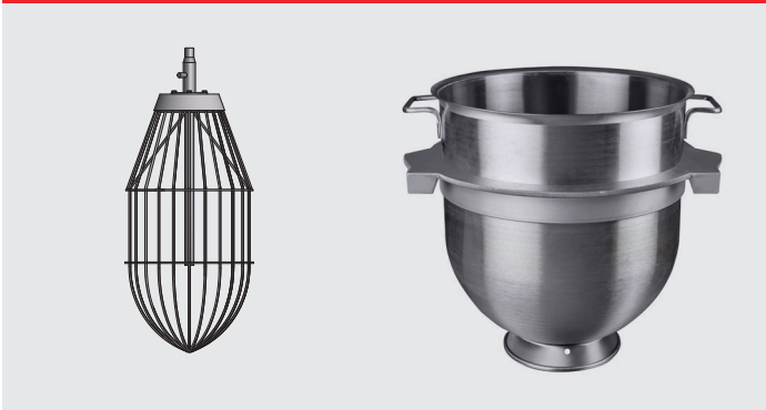
Double center reinforced whip with double pin in stainless steel and bowl 200 liter in stainless steel.