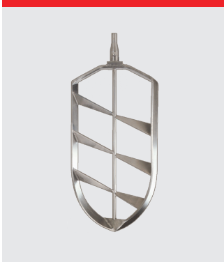
Beater with double pin, stainless steel