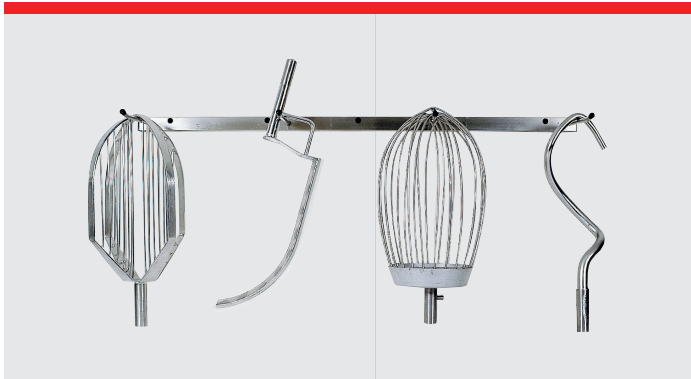
Tool rack, 127 cm