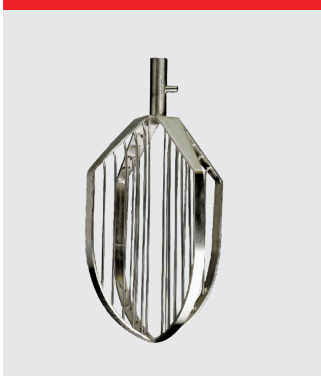
Wing whip with double pin, stainless steel