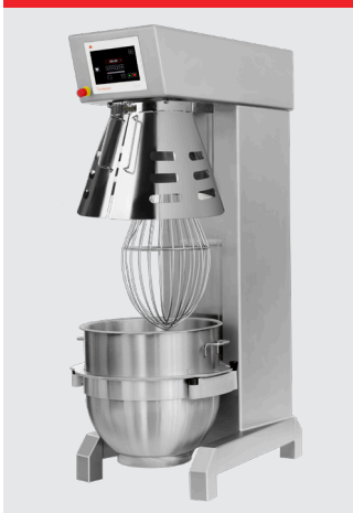
Marine version, stainless steel