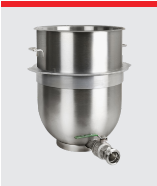
Bowl with bottom draining pipe, stainless steel