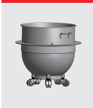
Wheels for bowl