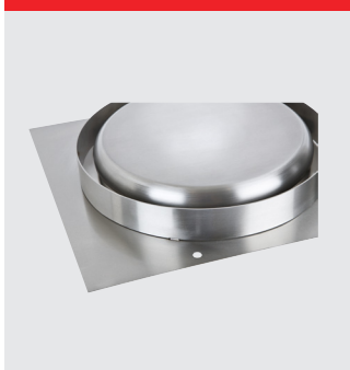
Air ventilation - Double layer protected, stainless steel, IP54