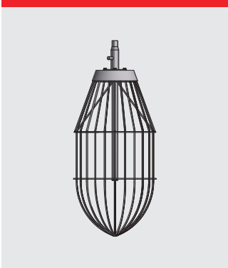
Whip with double pin, stainless steel