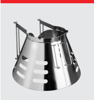
Removable safety guard in stainless steel. CE-certified