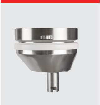
Waterproof planetary head, stainless steel, IP54