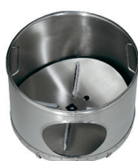
Wash insert with four brushes