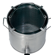
Peel collector stainless steel