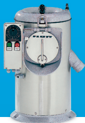
35 Pedestal model