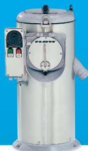
50 Pedestal model