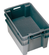
Peel collector plastic