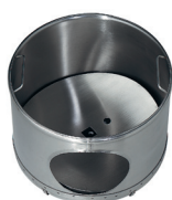
Wash insert without brushes