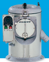
35 Bench model