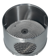
Wash insert with brushes