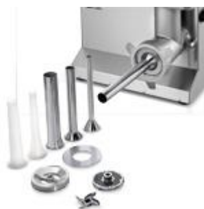
Optional: stuffer kit