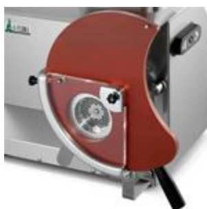
Optional: hamburger device Burger M