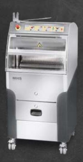
MHS BASIC SB

MHS BASIC SAVES YOU A GREAT DEAL OF MANUAL STEPS.