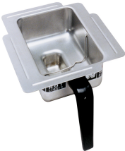
FUNNEL ASSY, SST-PP BLK HDL Product #: 29151.0000