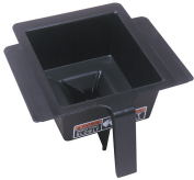
FUNNEL W/DECAL,PPK NAR BLK(SM) Product #: 02774.0011