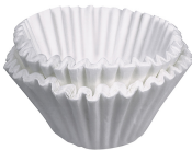
FILTERS,REGULAR1M 500/2 50/CL Product #: 20115.0000