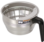
FUNNEL ASSY, SST-BLK HDL(7.12) Product #: 20216.0000