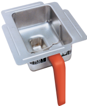
FUNNEL ASSY,SST-PP ORANGE HDL Product #: 29151.0001