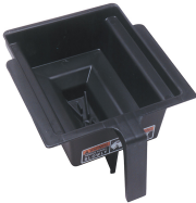
FUNNEL W/DECAL,PPK NAR BLK(LG) Product #: 04274.0012