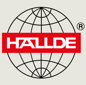
Food Preparation Machines Made in Sweden