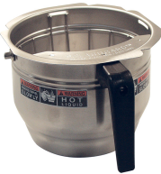
FUNNEL AY,W/DECAL GRT "C"7.62