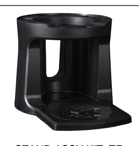
STAND ASSY KIT, TF SERVER