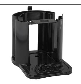
STAND ASSY, TF SERVER